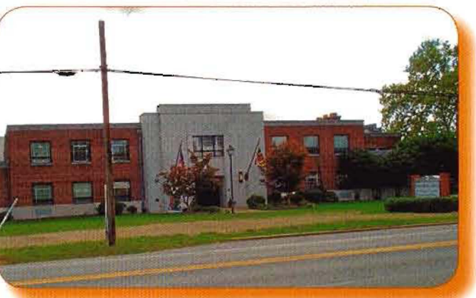
Today, the former Armory building serves as home for the Leonardtown Library. With more than 1,000 people utilizing the Library on peak days, the need for space and future expansion becomes a thought turned into reality.

On an average day, more than 700 citizens walk through the doors of the Leonardtown Library, taking for granted what a small group of citizens only dreamed about nearly 60 years ago - a public library for everyone to use and enjoy. Thanks to the determination of these dedicated citizens and a gift from Mary Patterson Davidson of Mechanicsville, their dream was realized when the Leonardtown Library celebrated its opening on October 15, 1950 in the historic Tudor Hall Mansion, which today serves as the home for the St. Mary's County Historical Society. During its tenure at Tudor Hall, the Leonardtown Library saw an