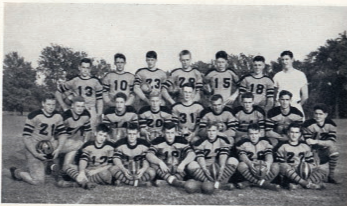
THE VARSITY FOOTBALL SQUAD. WINNERS IN SIX OF NINE GAMES IN 1939 SEASON