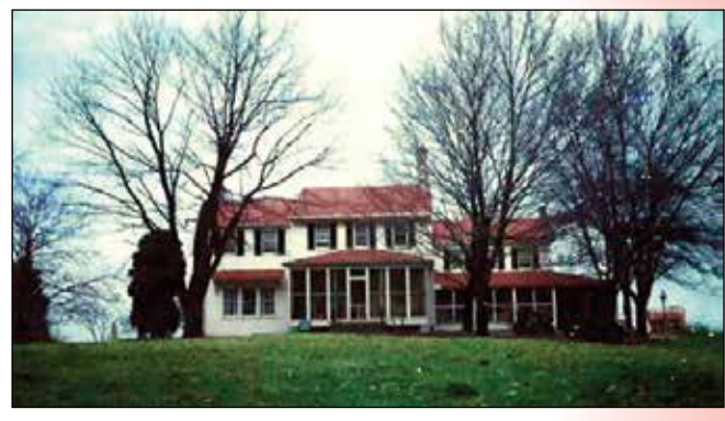
The original two-story manor home, built circa 1852, consisted of only the middle section. The East wing was added in 1872 and the west wing was added in 1924.

The two-story manor home, once curtained by large chestnut trees, was now framed by colorful