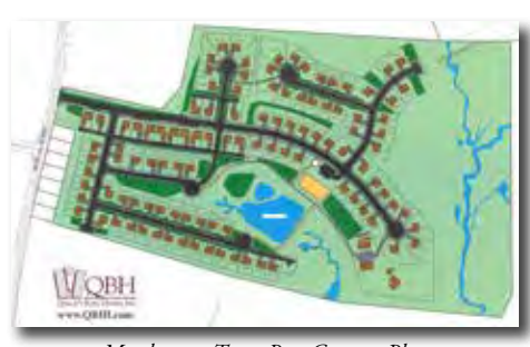
Meadows at Town Run Concept Plan

Local builder, Quality Built Homes, received the go ahead to begin construction of Phase One of a 107 lot subdivision to be called Meadows at Town Run. This project will be located on the Wathen Farm on the east side of Hollywood Road. Quality Built Homes is the builder that developed the