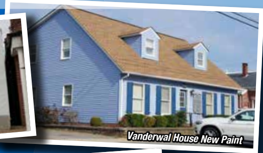
Vanderwal House New Paint