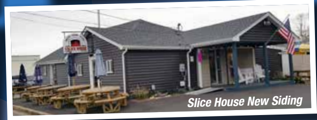
Slice House New Siding