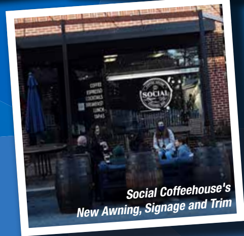
Social Coffeehouse's New Awning, Signage and Trim