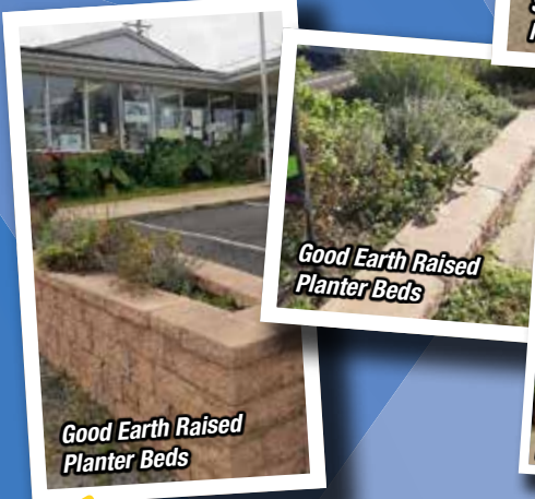
Good Earth Raised Planter Beds