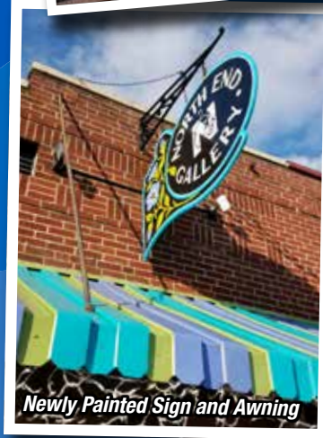
Newly Painted Sign and Awning