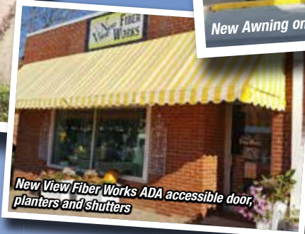
New View Fiber Works ADA accessible door, planters and shutters