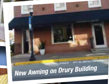
New Awning on Drury Building