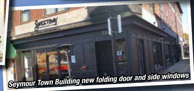
Seymour Town Building new folding door and side windows