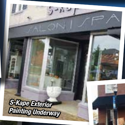
S-Kape Exterior Painting Underway