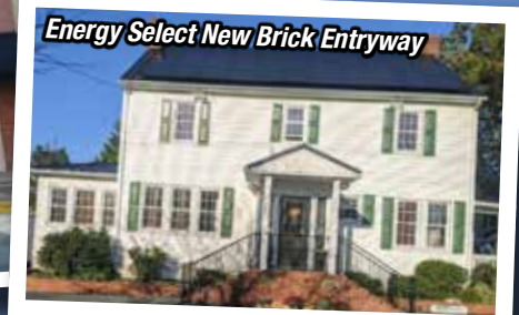
Energy Select New Brick Entryway