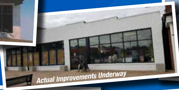
Actual Improvements Underway