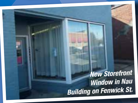
New Storefront Window in Nau Building on Fenwick St.